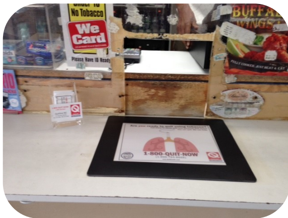
QuitlineNC marketing at a Healthy Corner Store checkout counter

Solution: When the Healthy Corner Store team members make visits to their assigned stores, they assess where healthier items can be placed to be more marketable and offer resources such as posters and promotional items. These visits provide a great opportunity to suggest that merchants display large QuitlineNC posters and even remove some tobacco ads. In addition, team members can educate merchants on youth access issues. Relationship building is critical, and sets the stage for these conversations to take place.