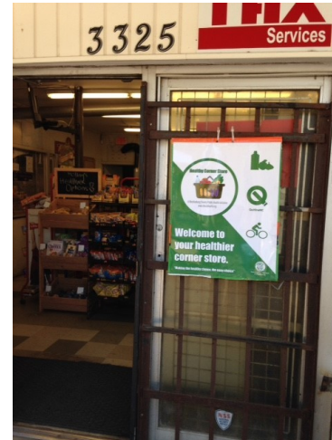
After: Health Corner Store Sign