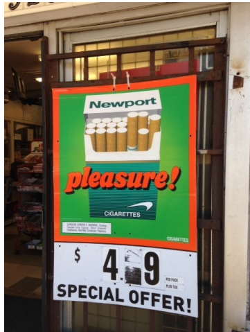
Before: Tobacco ad